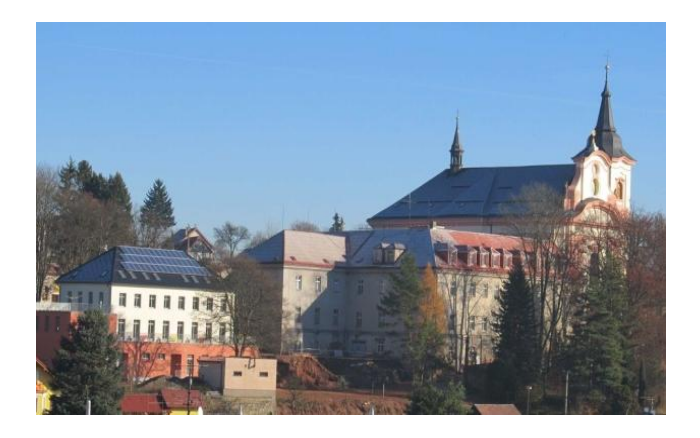
Visit us at: www.zbb.cz